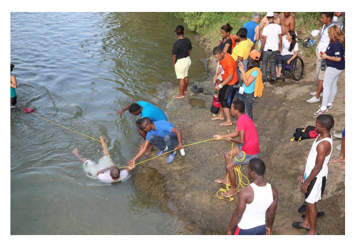
Demonstrating Swift Water Rescue Techniques