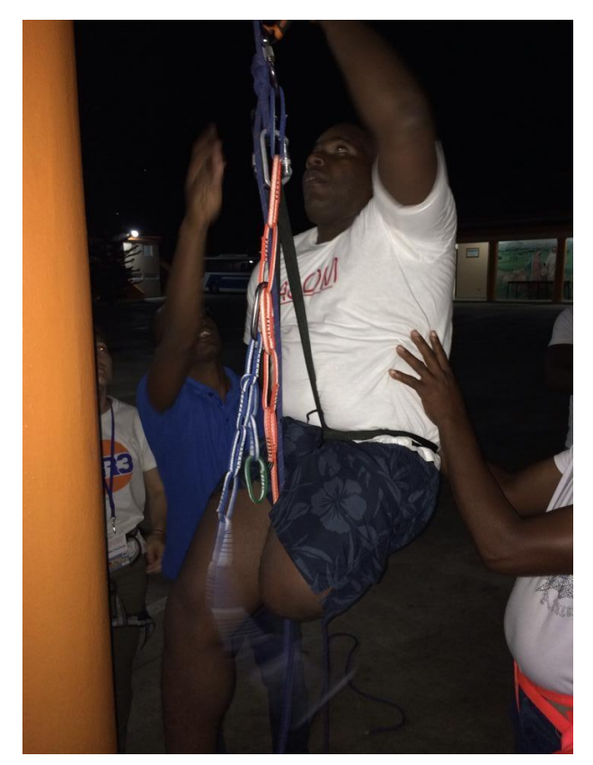
Empowering Disabled Youth in the DR